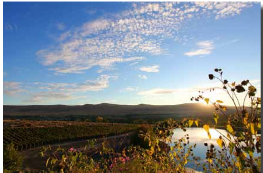
A late September afternoon at the beautiful Terra Blanca winery.